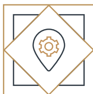
Current Model Analysis