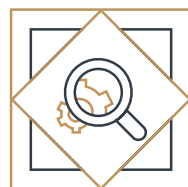
Initial Model Proposal